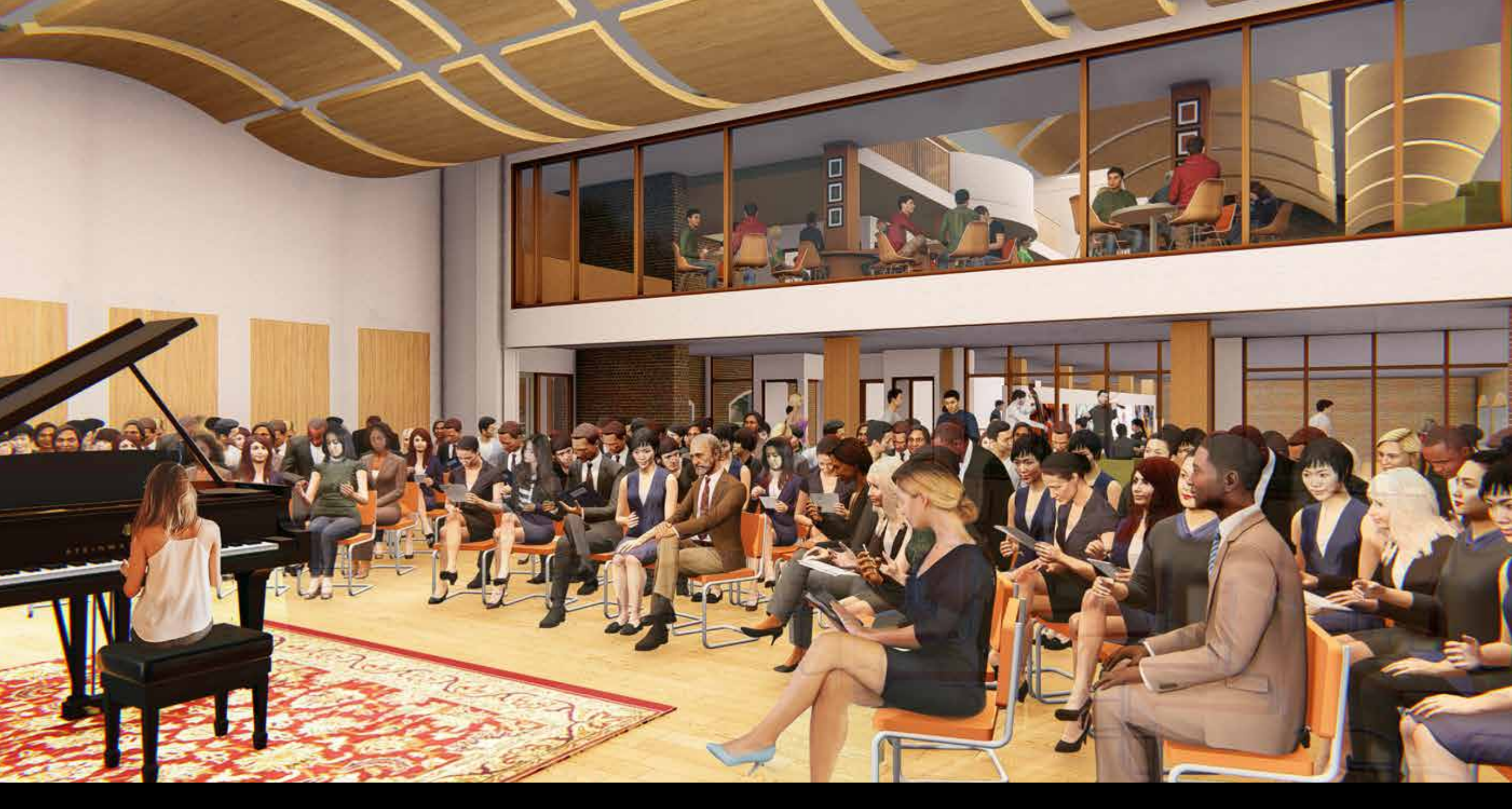
Dedicated band room and performance space with retractable windows into Learning Commons above